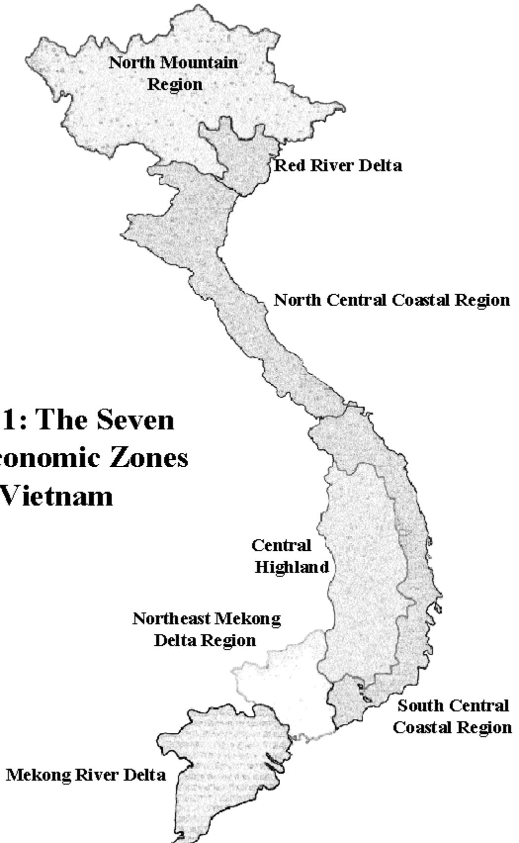
Figure 1: The Seven Agro-Economic Zones of Vietnam